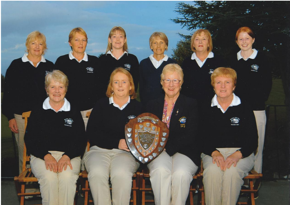
Congratulations to the winning Duhallow Shield team.