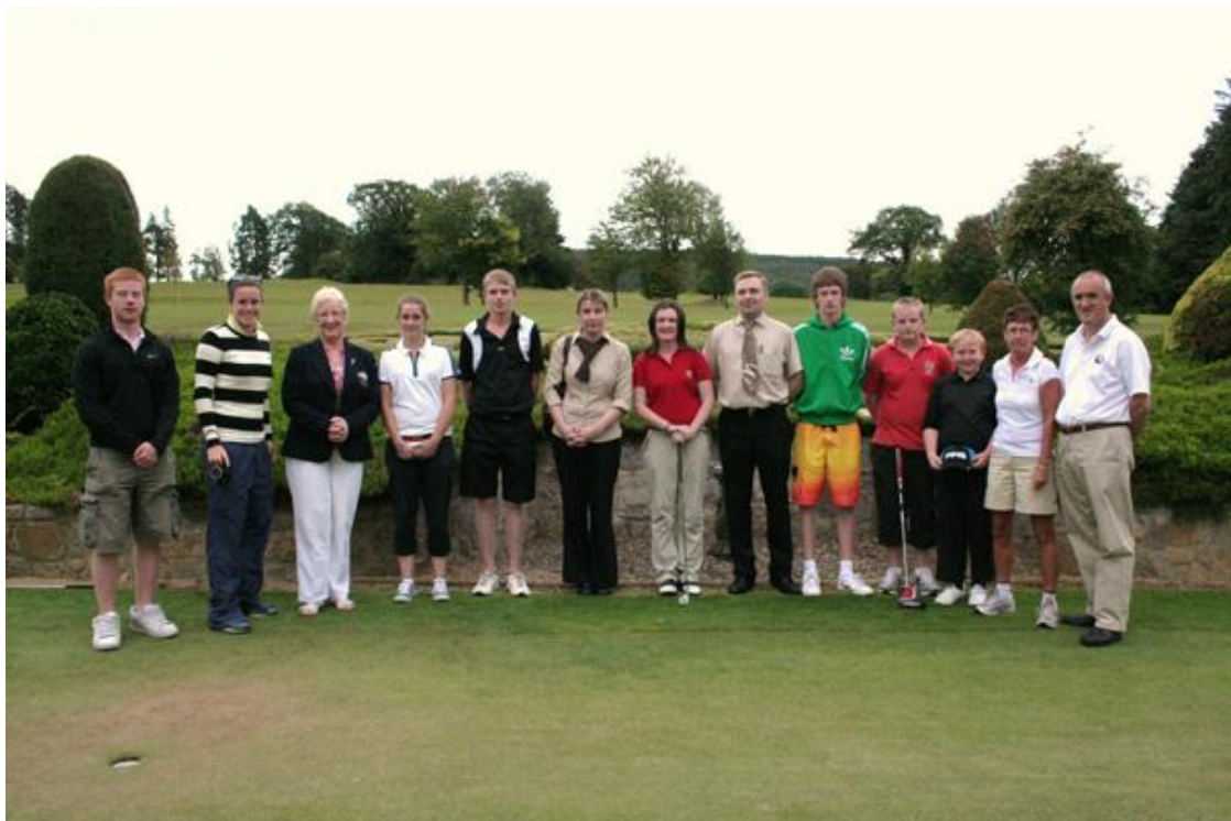
Mc Donald's Junior Open Winners. Thanks to Mc Donalds for their generous sponsorship.